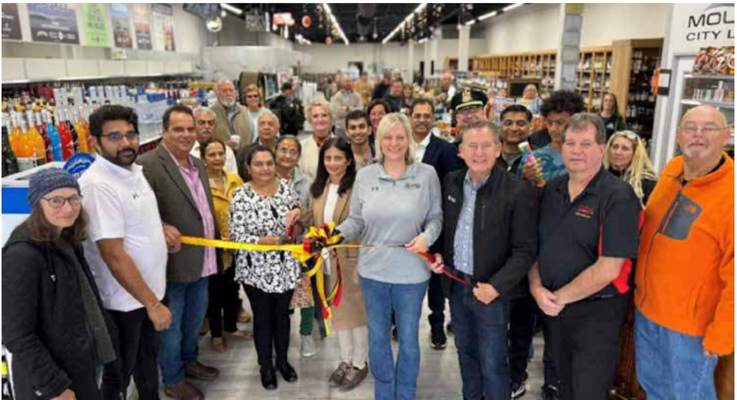
Mountain City Liquors