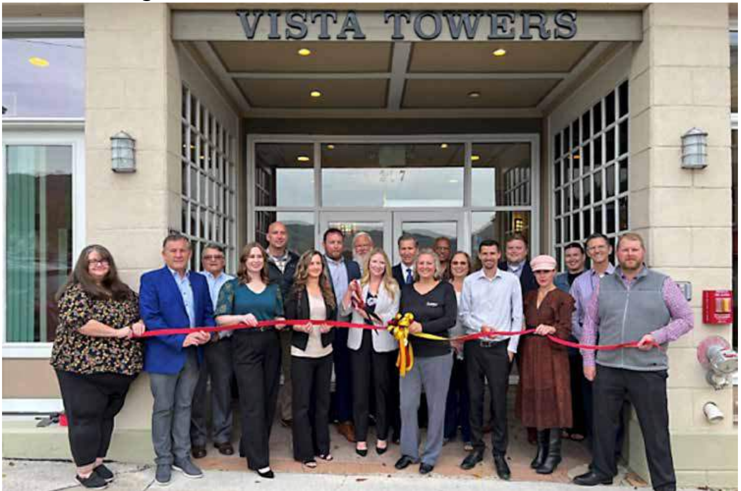
Wells Fargo Advisors